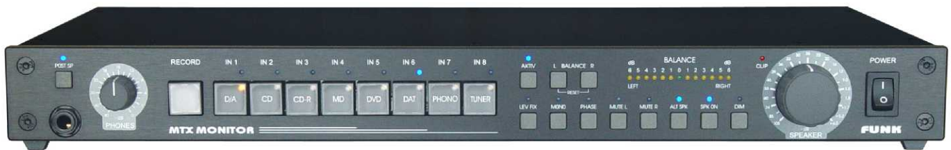
MTX-MONITOR.V3b, hi-fi version, black