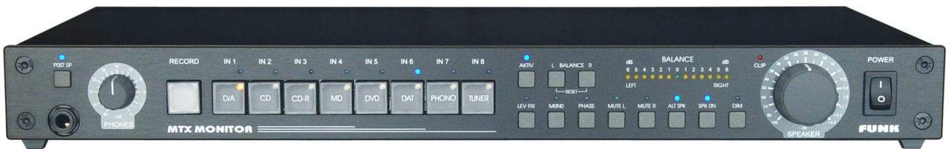
MTX-MONITOR.V3b-4.2.1, hi-fi version, black